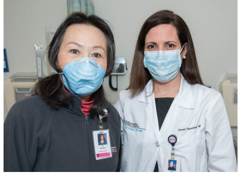
Masks for caregivers and visitors