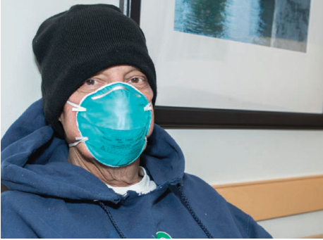
“N95 mask for patients”